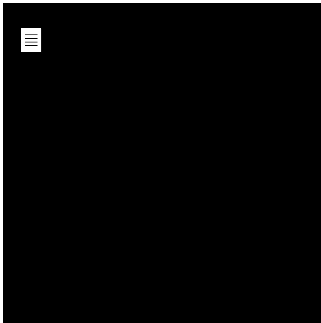
FIG. 1. Representative chromogenic reactions of selected organisms on CHROMagar. 1, E. coli ; 2, P. vulgaris ; 3, P. mirabilis ; 4, E. cloacae ; 5, C. diversus ; 6, Klebsiella pneumoniae ; 7, Salmonella typhimurium ; 8, Aeromonas hydrophila ; 9, Shigella sonnei ; 10, P. aeruginosa ; 11, Y. enterocolitica ; 12, M. morgani ; 13, Plesiomonas shigelloides ; 14, Serratia marcescens ; 15, A. calcoaceticus ; 16, Stenotrophomonas maltophilia ; 17, Enterococcus faecalis .

tance. The color colony reference was determined by two of the researchers and later confirmed by two other researchers. Where discrepancies occurred additional reference profile numbers were included (Table 1). Clear, white, and transparent colonies were not referenced because the color chart was not considered suitable for these colonies.